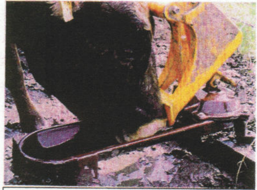
A Red Bar Ranches cow learning the ropes of pumping water with her nose.