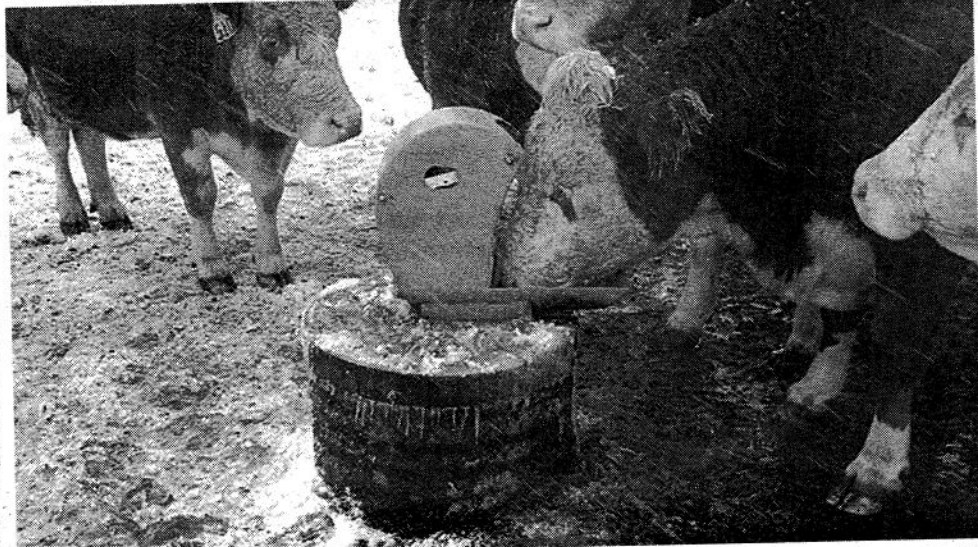
Frostfree Nosepump sits on top of a length of corrugated culvert that's set vertically into the ground.