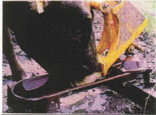
A Red Bar Ranches cow learning the ropes of pumping water with her nose.